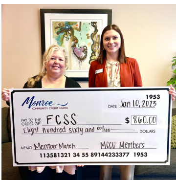
4th Quarter Member Match Check Presentation